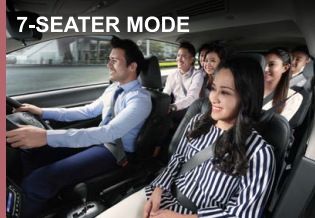
When you just need 2 more.