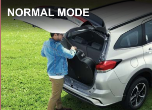
More room for more stuff.