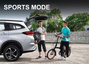
Pack it all in for weekend adventures.