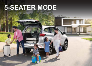
Road trips are always better with your loved ones.