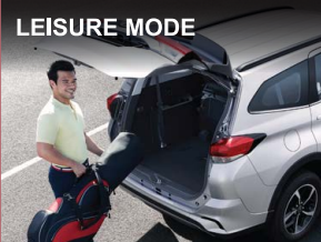
Load it up and pack it in.